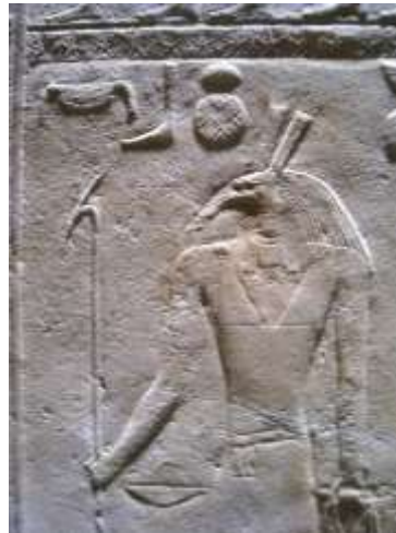
Mages of the Egyptian God Seth

Horus and Seth are two of Egypt's oldest deities, with roots going back to pre-dynastic times (before 3000 B.C.E.) Horus is associated with the falcon but Seth, as you can see in the pictures above, is represented by some sort of strange creature dubbed the "Seth animal" because no one is quite sure what kind of animal it is or whether it might be a composite of more than one animal. The relationship between these gods is complicated and, as we shall see, there is some confusion over the nature and identity of the god Horus.