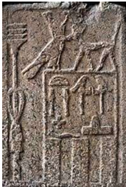
Only serekh depicting both Horus and Seth

The successor to Seth-Peribsen was Khasekhemwy, whose name means “The Two Powerful Ones Appear.” This is him above. He was the last king of the second dynasty and he too has a distinction. He is the only Egyptian ruler with a serekh that includes both Horus and Seth. A depiction of which we can see here