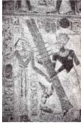
Depiction of the ladder to heaven

This text, one of many in the Pyramid Texts about this ladder, describes Osiris escorting Re up to heaven and the king asking for the ladder of Horus and Seth so he can become like Osiris and escort Re up the ladder. Eventually the ladder became associated with the body of Osiris and then the backbone of Osiris in the form of the Djed pillar. This image here, showing the raising of the Djed pillar/ladder, is a touch ironic. It shows Pharaoh Seti I, (named after the god Seth) functioning as Horus to raise the Djed pillar for the resurrection of Osiris, who was murdered by Seth.