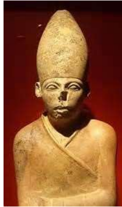
Image of King Khasekhemwy

patron deity. The lower part of the serekh shows a building, usually referred to as a palace. This king has the distinction of being the only Egyptian ruler to have a serekh showing only the god Seth. Identifying the king with Seth instead of Horus is obviously an important political move and highly controversial, suggesting strong lingering conflict between the Horus and Seth cults.